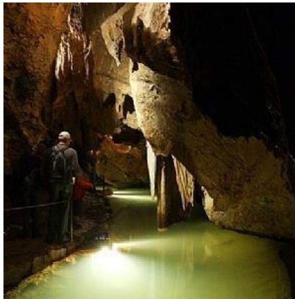
March 2017 - Jenolan Caves - Macarthur Seniors Tours Reservations