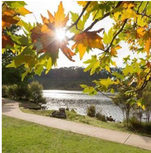
March 2017 - Jenolan Caves - Macarthur Seniors Tours Reservations