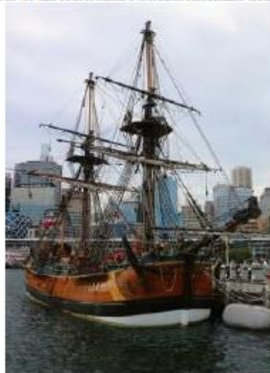
Replica HMS Endeavour at the Australian National Maritime Museum Sydney