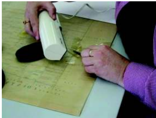
Using Heat to Remove Sticky Tape

We use a hair-dryer set to warm or small heat pads to activate the tape. Therapeutic heat pads that can be warmed in water or a microwave are excellent for this. Making sure they are dry, we place the pads over the sticky tape until it activates and then use a plastic spatula or a scalpel to lift the tape.