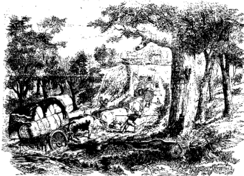
Bullock wagons hauling wool bales to the Sydney docks on the Great South Road. The road was so bad that drays could only travel at four miles an hour. ( Illustrated Sydney News , 16 December 1865)

We are all familiar with the M5 and many would have travelled over the Razorback on the Hume Highway before 1980. The Great South Road was on the western ridge from the Hume. It was built between 1829 and completed at Goulburn some eight or nine years later. For many it was never finished as it was a horror road and the worst stretch was the section over the Razorback Range.